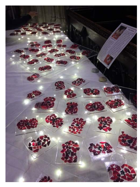
On display in the Church