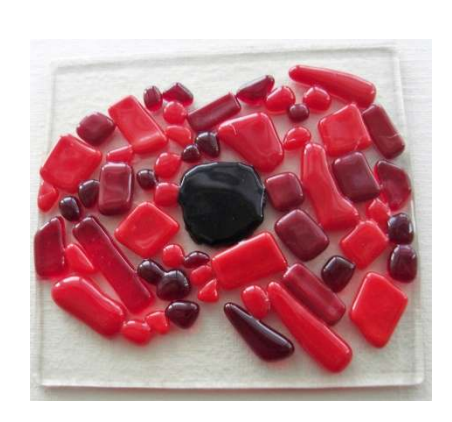
One of the finished Poppies